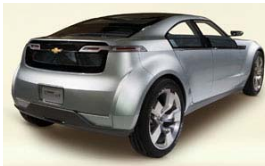
Look, no exhaust pipe

At this point, it is hard to say which lithium-ion variation will prevail. Toyota, which is pursuing its own battery development with Matsushita, will not say which chemistry it favours. GM is also hedging its bets. The company is testing battery packs from both A123 Systems and Compact Power for the Chevy Volt (pictured), a forthcoming plug-in hybrid that will have an all-electric range of 40 miles and a small internal-combustion engine to recharge its battery when necessary. To ensure that the Volt's battery can always supply enough power and meet its targeted 10-year life-span, it will be kept between 30% and 80% charged at all times,